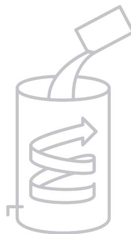
Pour WildBrew™ Sour Pitch into unhopped wort